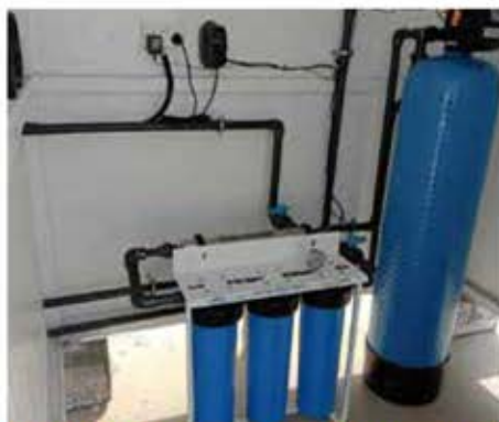
MULTIMEDIA & ACTIVATED CARBON FILTERS